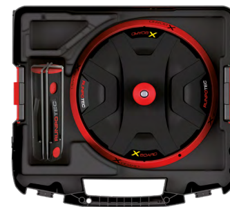
Symbolpicture -without content