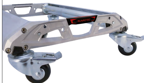
Castor - optional accessories